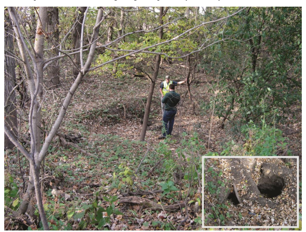
Fig. 2: A developing sinkhole found in the mapping area. The lower-right picture shows the central hole of the structure.

The bedrock surface of the Colwell 7.5' Quadrangle is comprised of Devonian strata which mainly consist of carbonates with minor shale and other lithologies. These Devonian carbonates form the important upper bedrock aquifer in the mapping area (Libra et al., 1984, 1994), and this aquifer becomes vulnerable when not covered by thick surficial materials. These carbonate rocks, especially those of relatively pure limestones, are also easily karstified (Fig. 2; Moore, 1995). Historic flooding in 2008 caused serious damages to north-central Iowa and created significant interest from local government and conservation groups. This led to the formation of several watershed protection and management coalitions and initiatives in north-central Iowa. Key societal concerns that can be addressed with geologic mapping projects in this area include watershed management, water quality and quantity issues, flood management, and aggregate production and resource protection. Thus, as part of the geologic mapping program in north-central Iowa, producing a bedrock geologic map for Floyd County was strongly recommended by the Iowa State Mapping Advisory Committee (SMAC), and approved by the National Cooperative Geologic Mapping Program (STATEMAP). The bedrock geology of the Colwell 7.5' Quadrangle is mapped as part of the second phase towards the completion of the bedrock geologic map of Floyd County.