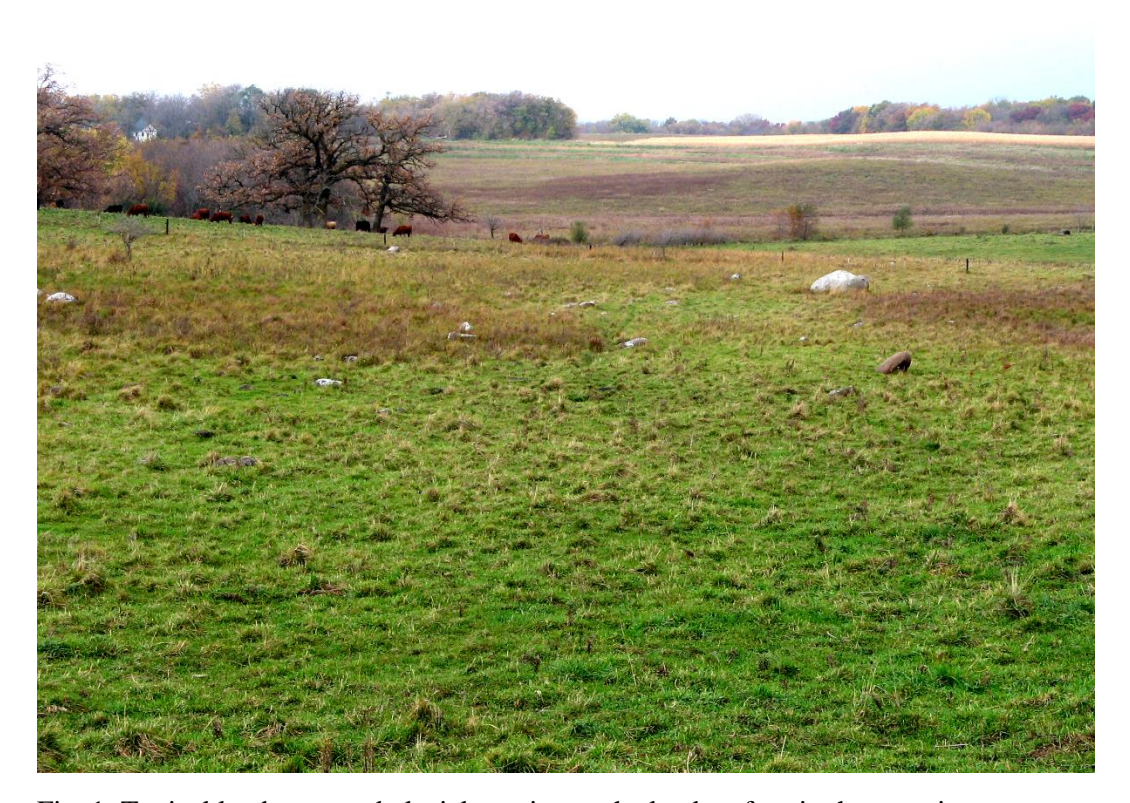
Fig. 1: Typical landscape and glacial erratics on the land surface in the mapping area.

The land surface of the Colwell 7.5' Quadrangle is almost completely covered by Quaternary sediments. In terms of landforms, this quadrangle lies in the Iowan Surface landform region where the land surface has been modified by various episodes of erosion before and during the Wisconsin-age glacial events (Prior, 1991). Due to extensive glacial and erosional activities, the landscape of this area is characterized by relatively low topographic relief, slightly inclined to gently rolling with long slopes, and open horizons. This landform region also features common fieldstones of glacial origin known as glacial erratics (Fig. 1). Two major rivers of north-central Iowa, the Wapsipinicon River in the eastern part and the Little Cedar River in southwest corner of the quadrangle, run through the mapping area.