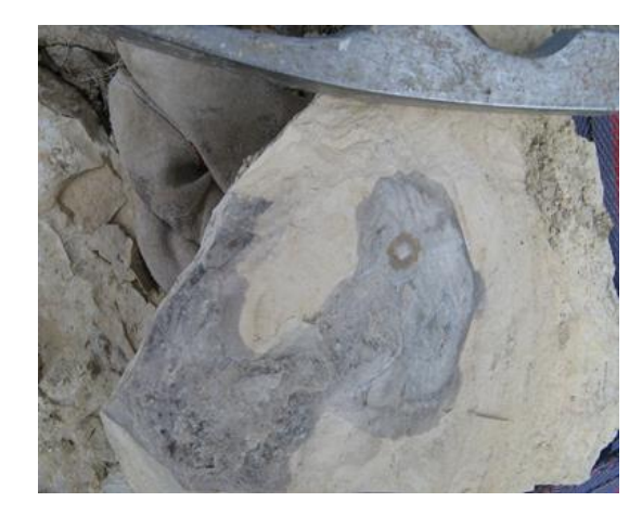
Fig. 6: Cherty nodules in the Little Cedar Fm.

ArcGIS 10.3 software and on-screen digitizing techniques developed during previous STATEMAP projects has been used for this mapping project. The newly compiled bedrock geologic map is stored and available as a shapefile in the NRGIS library of the Iowa Department of Natural Resources (IDNR), and as a PDF file on the IGS Publications website <a href="http://www.iowageologicalsurvey.org">http://www.iowageologicalsurvey.org</a>.