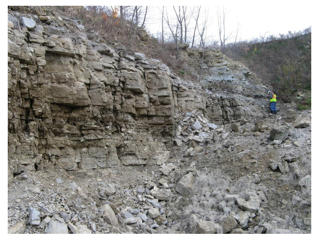
Fig. 4: Northern wall of the Deerfield Quarry which is partially located in the map area.