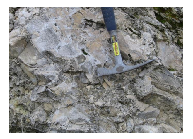
Fig. 5: Brecciated texture in the Coralville Fm.