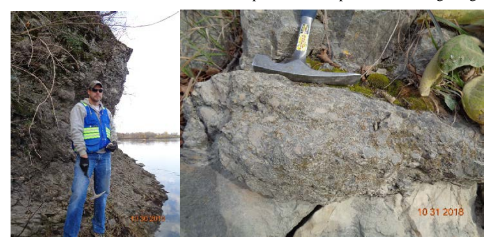
Fig. 3: Bedrock outcrops in the Center Point NW 7.5' quadrangle. Left: The Little Cedar Formation occurs along Cedar River at the Hoefle Dulin Recreation Area. Right: Coralville Formation with breccia occurs in the mapping area.