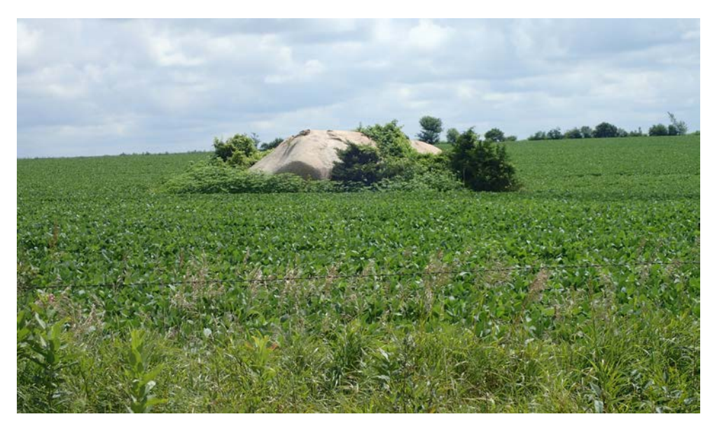
Fig. 2: Large glacial erratic on the land surface of the Iowan Erosion Surface landform region.

The Quaternary sediments in the mapping area consist of loamy soils developed in loess, glacial till, and colluvium of variable thickness, and alluvial clay, silt, sand, and gravel. The thickness of the Quaternary deposits usually varies between 8 and 24 m (25-80 ft), with a maximum of more than 60 m (200 ft) in deep bedrock valleys in the northeast and south central portion of the quadrangle. These unconsolidated Quaternary sediments are undifferentiated in this map. For the detailed Quaternary stratigraphy and distribution, see the surficial geologic map of this quadrangle (Kerr et al., 2019).