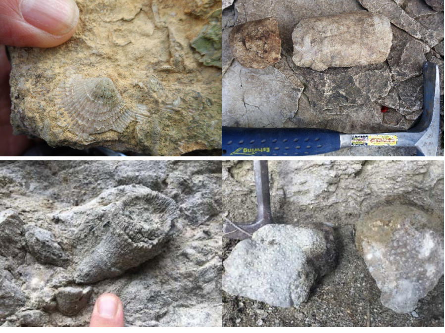
Fig. 4: Some typical fossils from the Devonian strata in the mapping area. Upper left: brachiopod; Upper right: cephalopod; Lower left: rugosa coral; Lower right: colony coral.