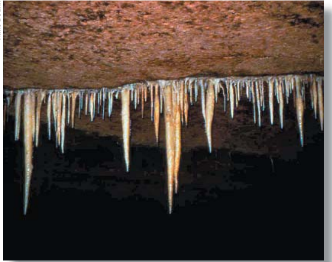
Cave formations (speleothems) that hang down from the ceiling of a cave are called stalactites and are made of calcium carbonate.

known as phreatic (water-filled) conditions. Later, if the water table falls, the cave will be partly drained. The remaining water occupying the lower part of the cave forms a stream, similar to a surface stream. Once this stream is formed, enlargement of the cave is then usually limited to erosion of the stream bed. These mostly air-filled conditions are called vadose conditions. The stream commonly cuts a vadose canyon below the original phreatic tube. The lower part of this canyon will often be refilled by clay, mud, and gravel in areas where flow has slowed. This can occur upstream of a pile of collapsed ceiling or wall rock, known as breakdown. Also, where a stream flows over an irregularity in the floor it sometimes deposits calcium carbonate, forming a rimstone dam . The resulting pool upstream from the dam can then fill with sediments as well.